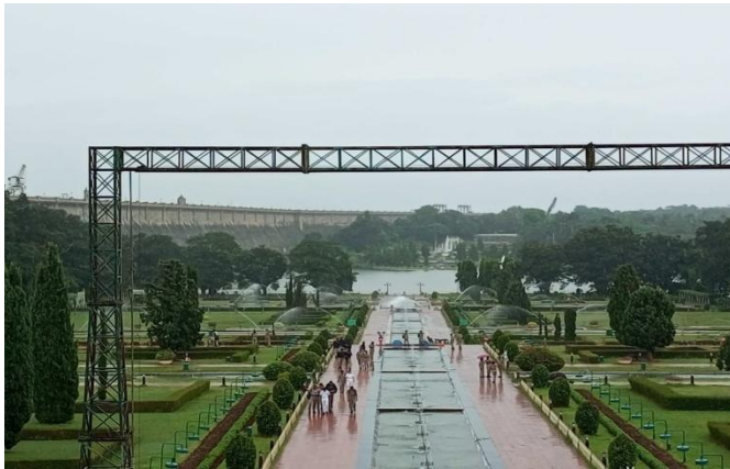
Krishnaraja Sagara Dam (KRS) & Brindavan Garden