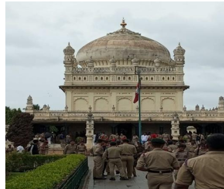
Gumbaz Srirangapatna – Tipu Sultan's Mausoleum