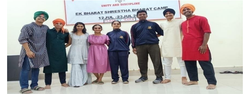
The gesture after the performance for the Cultural event Team Bangalore-B Group.