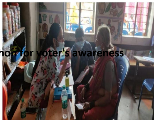
Walkathon for voter's awareness