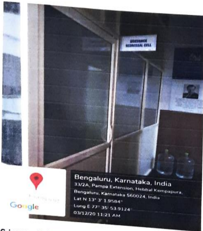
Grievance Cell – I Floor