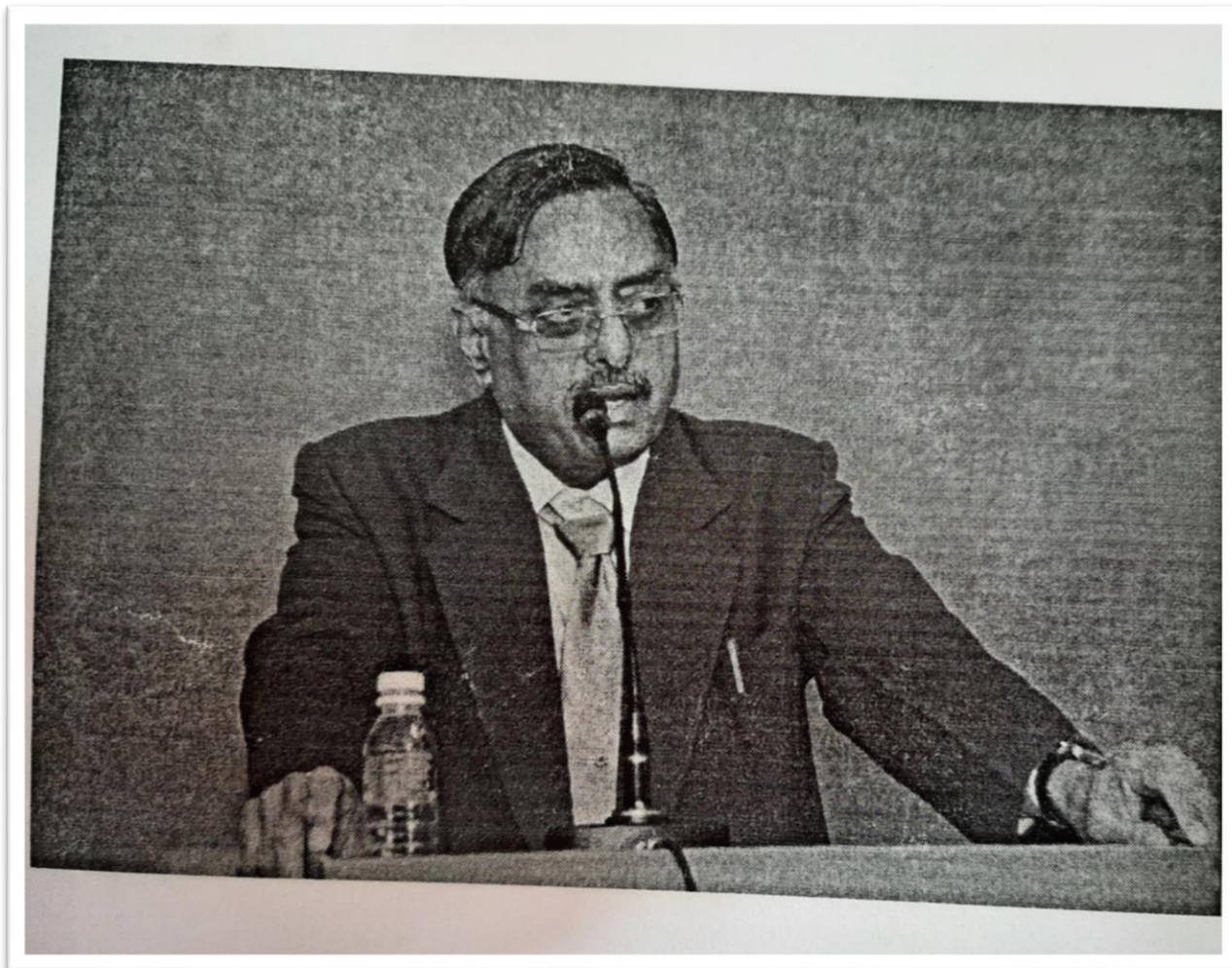
Workshop on New Guidelines on NAAC Criteria on 23/10/2017